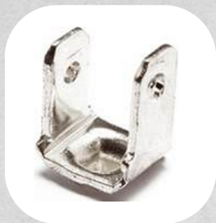
Ref: 0209 Terminal 4.8 U