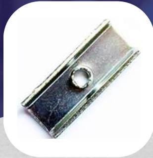
Ref: 1802 Fixador 25mm