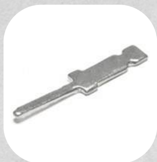
Ref: 0806 Terminal CI Longo