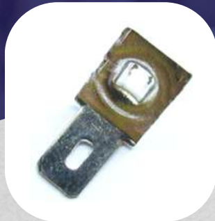
Ref: 0227 Terminal 1113 cortado