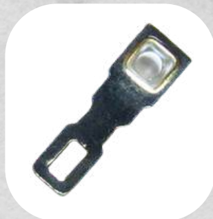
Ref: 0268 Terminal 3417 L Cortado