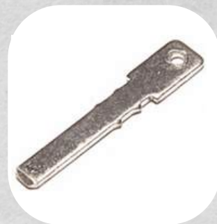
Ref: 0213 Terminal 1.3829/001