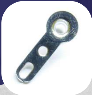
Ref: 0295 Terminal 1.30881005