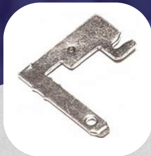
Ref: 0222 Terminal GM