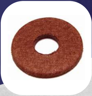
Ref: 0701 Arruela Fibra Vermelha