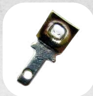
Ref: 0202 Terminal 2,8 cortado