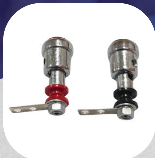
Ref: 0536 Par borne 32mm Metal