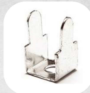
Ref: 0103 Terminal Baloon