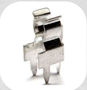
Ref: 0100 Term. Porta Fusível