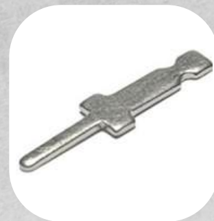
Ref: 0804 Terminal CI Curto