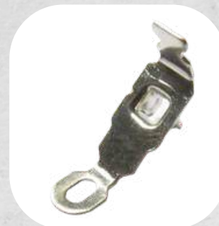
Ref: 0233 Terminal 1.3143/004