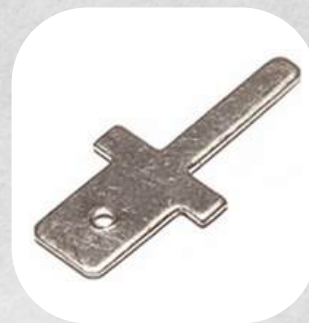
Ref: 0604 Terminal 4.8 Macho