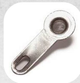
Ref: 0216 Terminal 19 LD