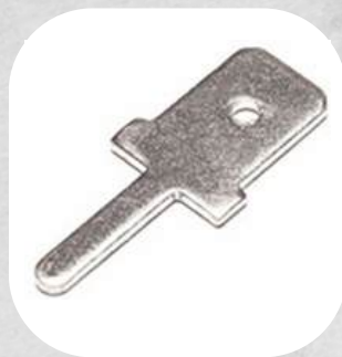
Ref: 0603 Terminal 6.3 Macho