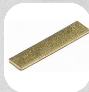
Ref: 0808 Terminal Distanciador