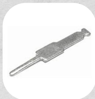
Ref: 0807 Terminal Espadão