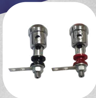
Ref: 0537 Par Borne 34mm Metal