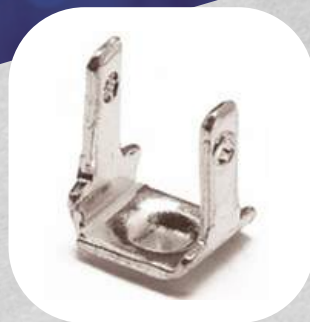
Ref: 0204 Terminal 2.8 em U