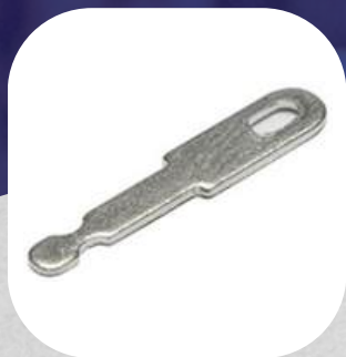
Ref: 0802 Terminal Trafos Médio