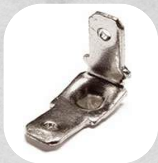
Ref: 0208 Terminal 4.8 invertido