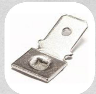
Ref: 0224 Terminal 6.3 cortado