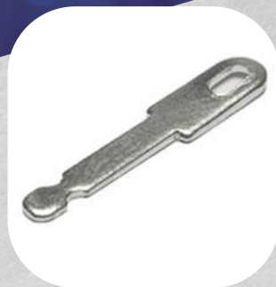
Ref: 0803 Terminal Trafos Médio