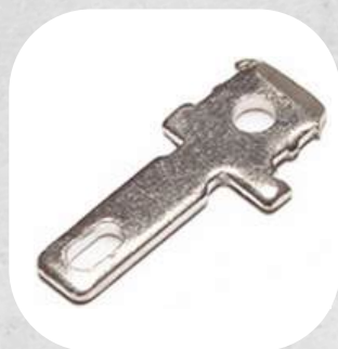
Ref: 0215 Terminal 1.3863/061