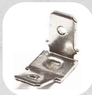
Ref: 0210 Terminal 6.3