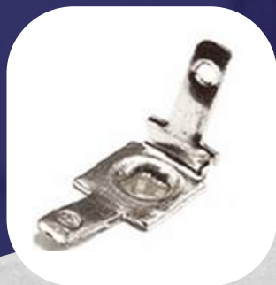
Ref: 0277 Terminal 2.8 normal