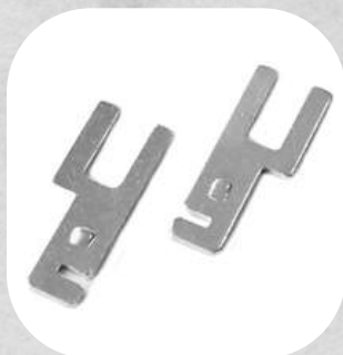
Ref: 0246 Fox duplo direito e esquerdo