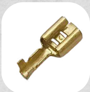
Ref: 0256.01 Terminal fêmea 6,3 unitário