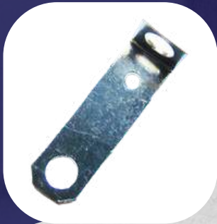
Ref: 0287 Terminal L Novo