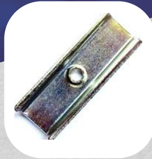
Ref: 1803 Fixador 45mm