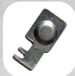
Ref: 0607 Contato de Pilha