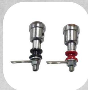
Ref: 0538 Par Borne 40mm Metal