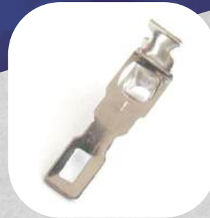
Ref: 0252 Terminal 3417 normal latão