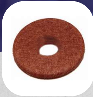
Ref: 0703 Arruela Fibra Vermelha com repuxo