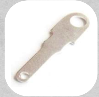
Ref: 0261 Terminal Espadilha Olhal