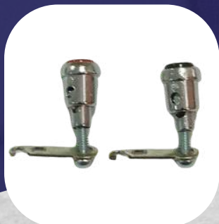
Ref: 0535 Par Mini Borne Metal