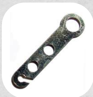
Ref: 0258 Terminal 012414