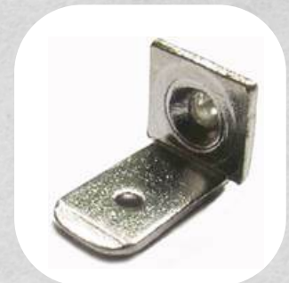
Ref: 0269 Term. 6.3 Cortado repuxo redondo