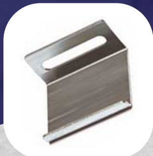
Ref: 0713 Apoio