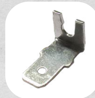
Ref: 0276 Terminal 6.3 sem repuxo