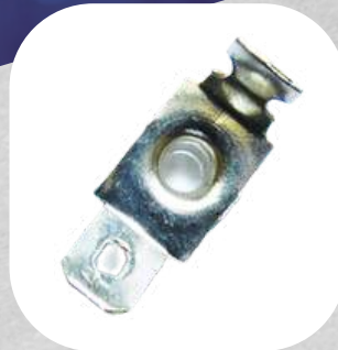
Ref: 0273 Terminal 111B Repuxo maior