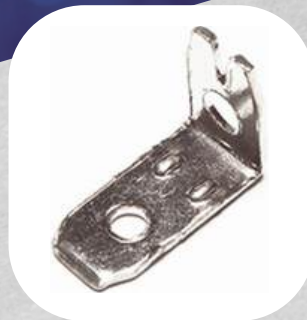
Ref: 0279 Terminal FORD