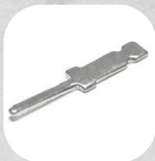
Ref: 0805 Terminal CI Médio