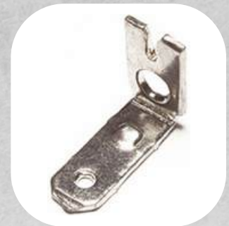
Ref: 0280 Terminal FIAT