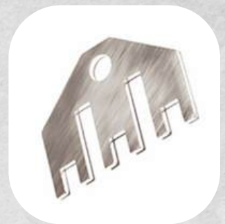
Ref: 0606 Terminal Contato Compacto