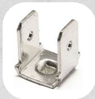
Ref: 0211 Terminal 6.3 U