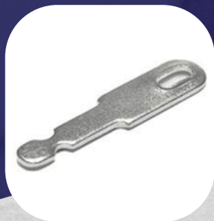
Ref: 0801 Terminal Trafos Curto