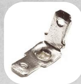
Ref: 0205 Terminal 4.8 normal