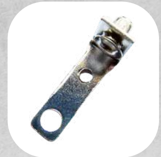
Ref: 0210.01 Terminal L com Ilhós