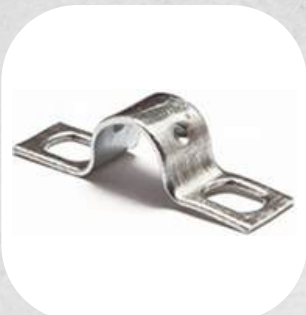
Ref: 0102 Term. Braçadeira