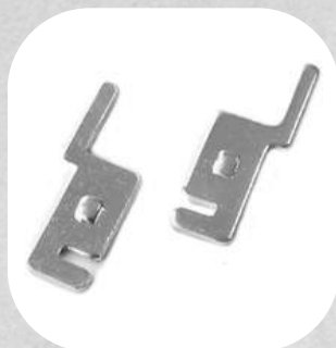
Ref: 0248 Fox simples direito e esquerdo