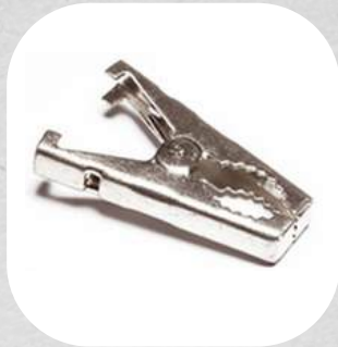
Ref: 0506 Garra Jacaré