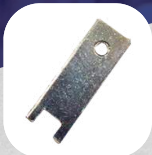
Ref: 0232 Apoio