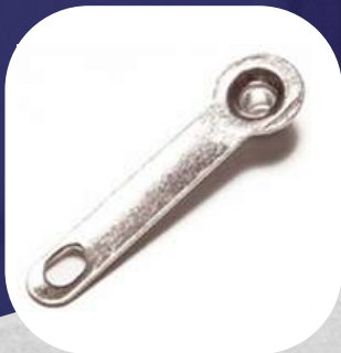
Ref: 0217 Terminal 23 LD