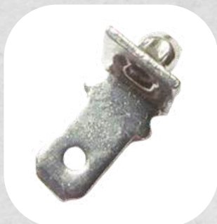
Ref: 0234 Terminal 4.8 Cortado