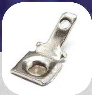
Ref: 0202 Terminal cortado