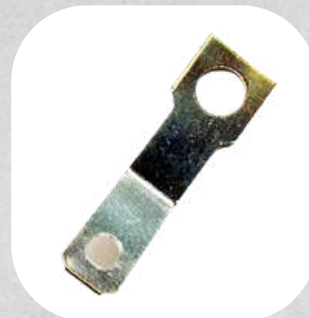
Ref: 0285 Terminal MA 75.275