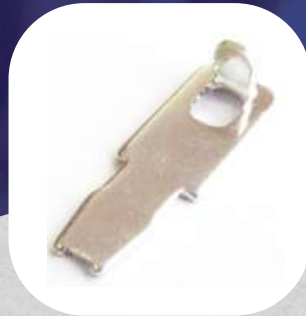
Ref: 0297 Terminal 0122227