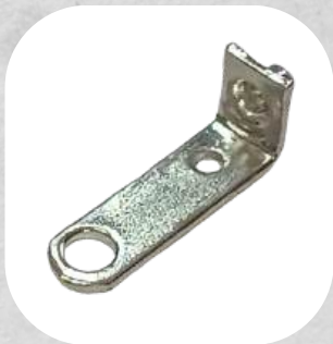
Ref: 0262 Terminal 63180 L