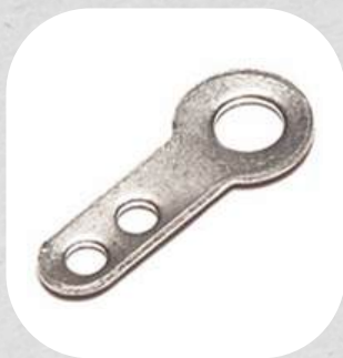
Ref: 0602 Terminal PZ013